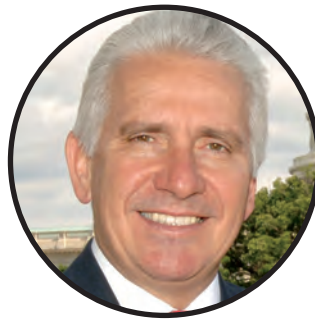
Congressman Jim Costa